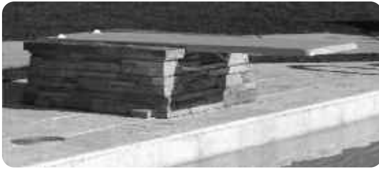
Part # 7700